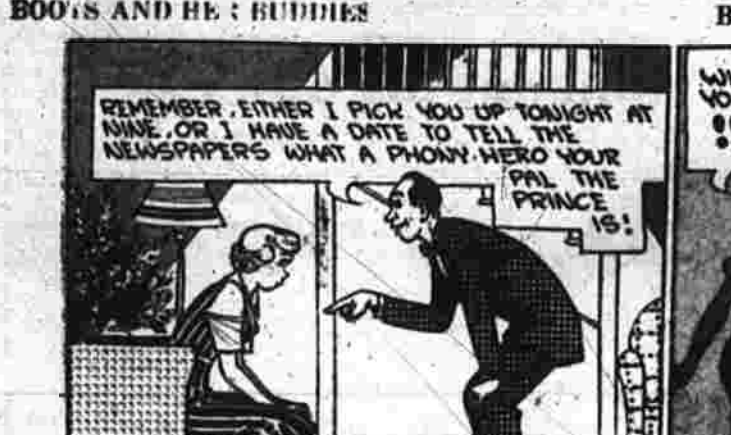
BOO'S AND HE: BUDDIES