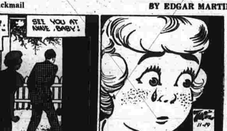
BOO'S AND HE: BUDDIES