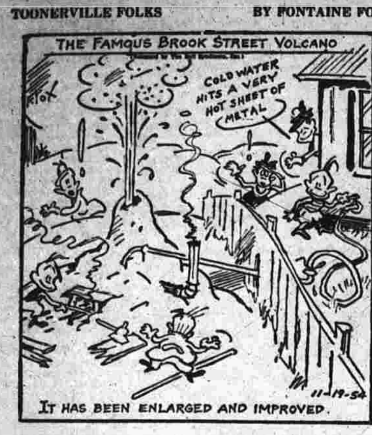
IT HAS BEEN ENLARGED AND IMPROVED.